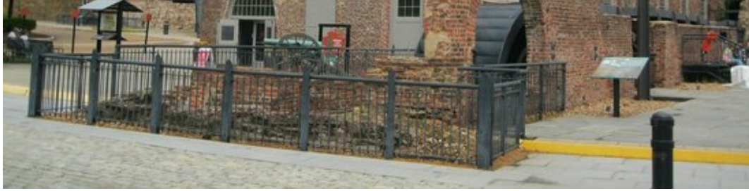
The Pattern Building (Crenshaw Woolen Mills) at Tredegar Iron Works.