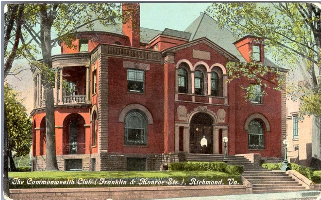
The Commonwealth Club (Franklin & Monroe Sts.), Richmond Va.

Hospitality room hours and location to be determined.