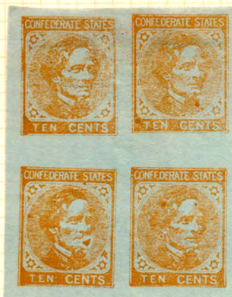
WIDE BORDERED TYPE

L.H. HARTMANN HAS: BLOCK: - BROWN ON WHITE " - BROWN ON PINK