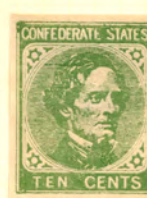
WHITE WIRE WOVE PAPER