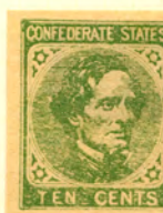
YELLOW WIRE WOVE PAPER

PRIVATE PRINTS FROM A CLICHE' PROBABLY MADE BY PHOTOGRAPHICALLY COPYING A SINGLE SPECIMEN OF A STAMP FROM THE REVALUED PLATE.