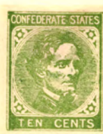
WHITE WOVE PAPER