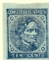
COLORED WOVE PAPERS