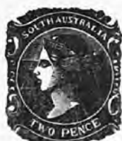
South Australia, 1868.