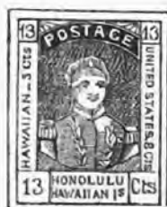
Sandwich Islands, 1853.