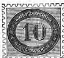
N. German Confed., '69.