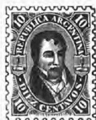
Argentine Republic, '67.