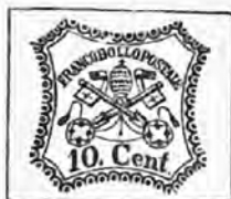
Roman States, 1867.