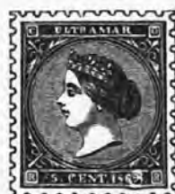
Spanish W. Indies, 1869.