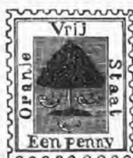
Orange Free State.