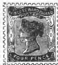
Pr. Edward Island, 1869.