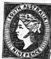
South Australia, 1869.