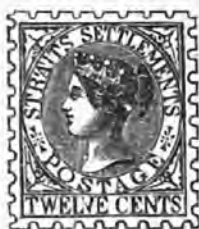
Straits Settlement, '68.