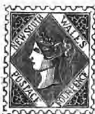
N. South Wales, 1867.