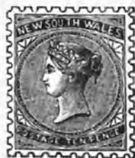
New South Wales, 1868.