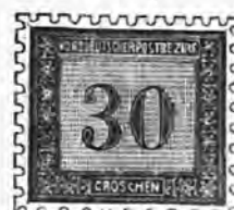
N. German Confed., '69.