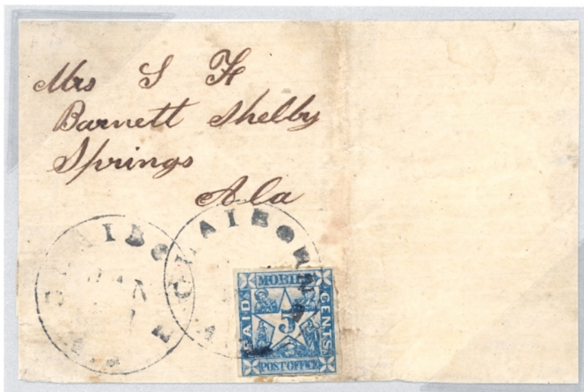
Postmarked Claiborne, Alabama, January, 1862 5¢ rate to Shelby Springs

Only two stamps were postmarked and accepted for prepayment outside of Mobile