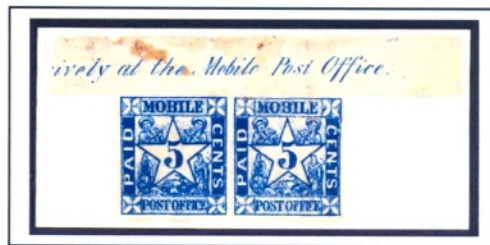
Tapling Collection, scan of photograph at 75%

A top sheet margin pair from the Tapling Collection in the British Library in London (illustration above) shows a similar imprint above Mobile 5¢ provisional stamps. It reads in part: “[exclus]ively at the Mobile Post Office.” Only one other top imprint copy is known from Mobile (shown later). Due to their scarcity, it is possible the top imprint was also added to the Mobile pane after the initial printing.