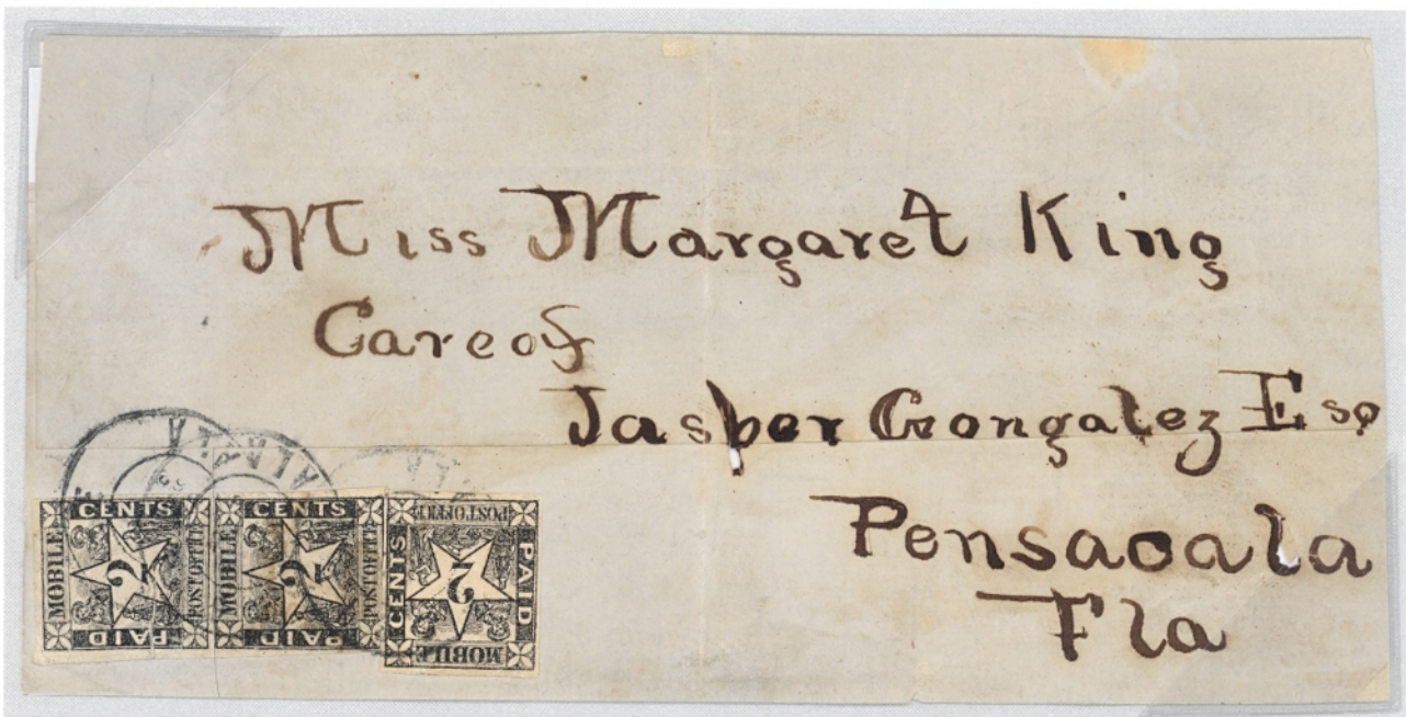
1862 triple rate wrapper to Pensacola