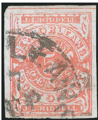
The 5c Red Provisional

All the New Orleans adhesive provisionals were engraved on wood and reproduced as stereotypes or electrotypes. From these plates of 40 subjects were prepared.