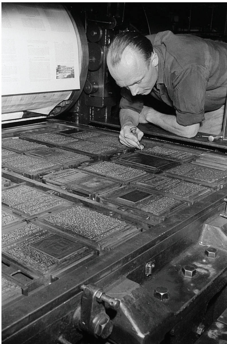
Figure 9. A letterpress (typography) press operator. This is the method that was used for printing the de la Rue Confederate stamps.