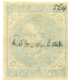
Figure 17a and 17b (above). Face and back of CSA No. 6 plate proof signed on the back by Robson Lowe. Steve Feller