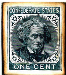
Figure 12. CSA 1¢ proof on card stock.

to print them in Richmond. A contract was entered into and various deliveries took place. The first attempt at a delivery began at the end of January 1862 and was successful. This resulted in 2,150,000 stamps being received in Richmond, along with paper and ink. A few undocumented shipments followed. In total, according to Dietz, about 17 million CSA No. 6 5¢ stamps were printed, of which about 12 million made it through the blockade. Also, 400,000 CSA No. 14 1¢ stamps were printed and shipped to Richmond, although these were never postally used during the Confederate period.