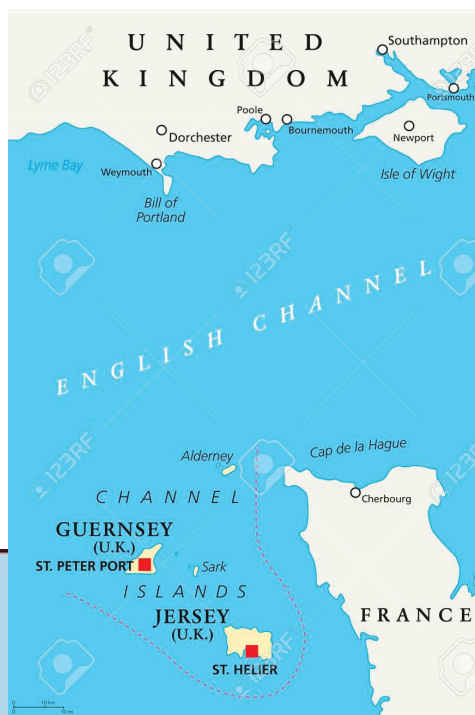
Figure 1a (above) and 1b (left). Maps of the Bailiwick of Guernsey, a British Crown Dependency (legally not part of the U.K.). Note that the birth site of Thomas de la Rue was in Forest (near the modern-day airport) and this is at the Southern end of the main island (seen in Figure 1b). This main island is about four miles in its maximum land dimension and it is shaped like a triangle.