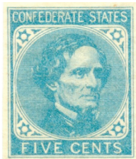
Figure 13 (left). Example of 5¢ CSA No. 6.

Figure 14 (right). UL margin block of four 5¢ Richmond printing, CSA No. 7-L, locally printed on London paper.