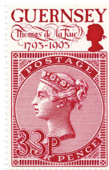
Figure 7 (below). Guernsey 33-pence stamp issued in 1993. It honors the 200th birthday of Thomas de la Rue.