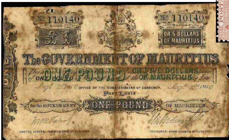
Figure 4. De la Rue one-pound from Mauritius, 1860. This is an example of the first paper money printed by de la Rue.