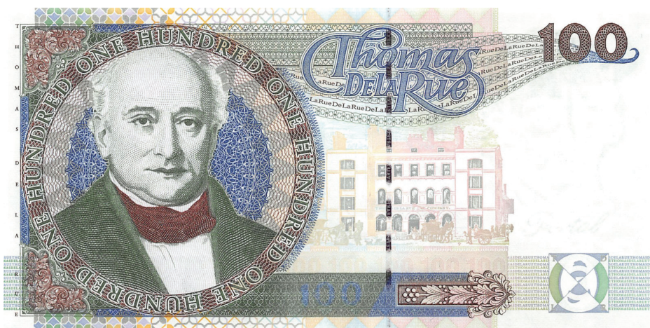
Figure 6 (below left). Image of Thomas de la Rue on a 1996 de la Rue company test note.

By the start of the American Civil War the company was one of the leading stamp printers in the world. The stage was set for the Confederate stamps. Since Thomas de la Rue died in 1866, he was still alive at the time of the printing of the CSA 6 and CSA 14 stamps, and the production of the plates,