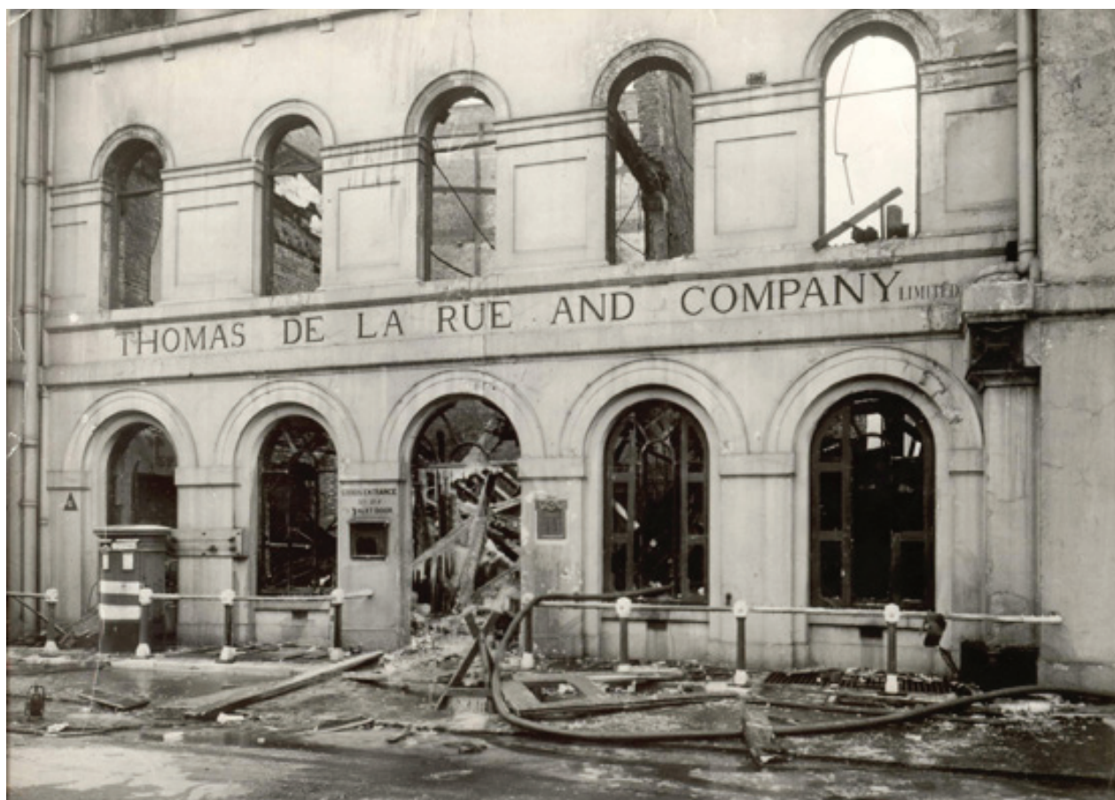
Figure 5. Thomas de la Rue and Co., 110 Bunhill Row, East Central London. This picture was taken shortly after the German Blitz bombing of Sept. 11, 1940. De la Rue took a direct hit. This was the location where the London printing of Confederate stamps took place.

Finally, in 1860, de la Rue started to print paper money, commencing with Mauritius, as shown in Figure 4.