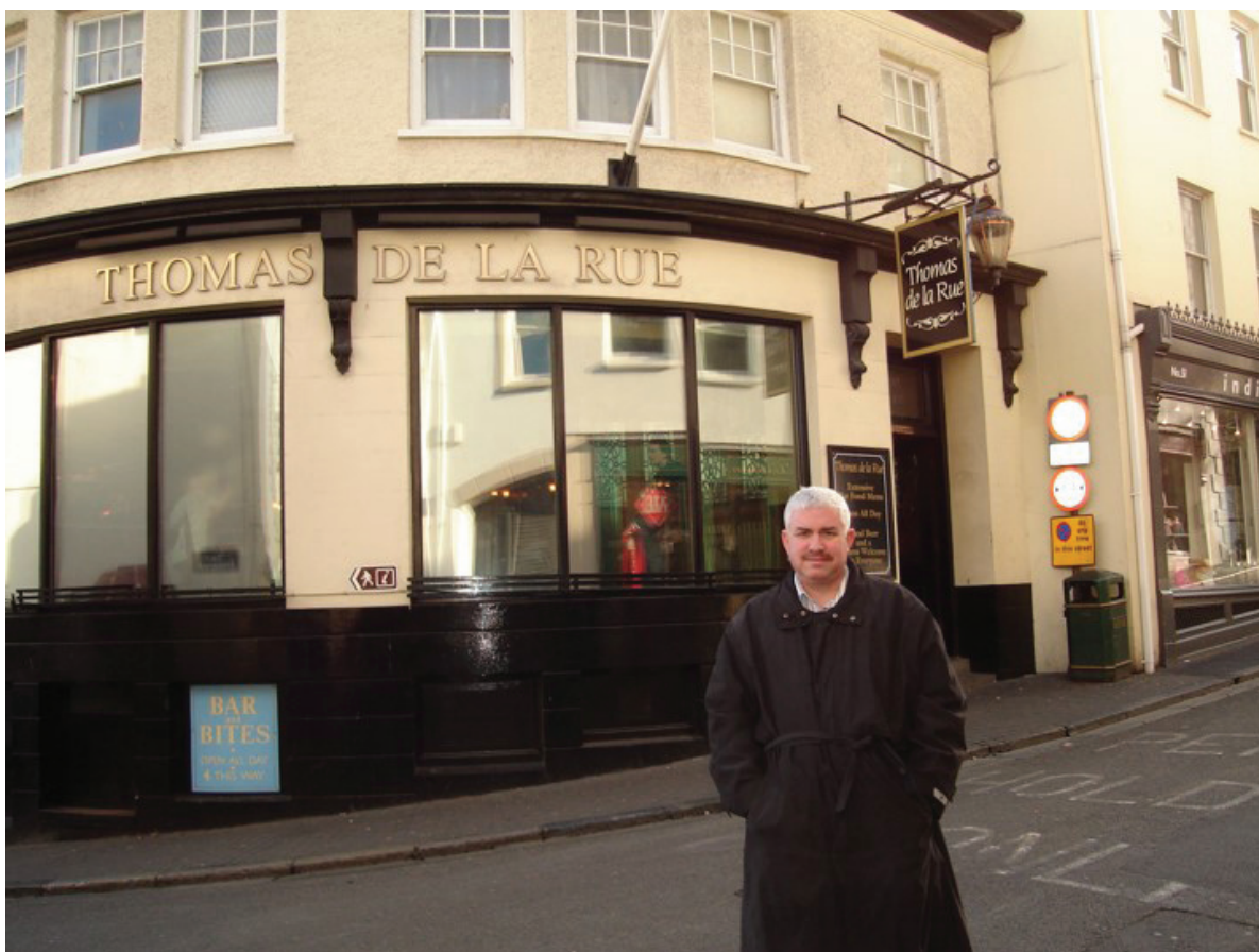
Figure 8: The author stands in front of the Thomas de la Rue pub in St. Peter Port, Guernsey in 2006. This is near the birthplace of de la Rue.

ink and paper used to print CSA 7-L and CSA 7-R in Richmond, Va. (The numbering of the stamps is taken from the 2012 CSA Catalog .)