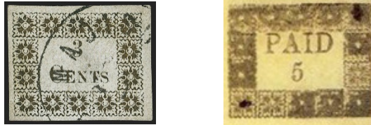
Example of the 3c Madison provisional stamp and the 5c provisional entire.

The 3c Madison provisional was typeset and printed for use during the period between the establishment of the Confederacy on 4 February and 1 June 1861 when the Confederacy took control of the postal service.