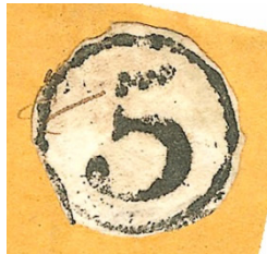
The Oakway adhesive provisional

The Oakway provisionals were prepared by handstamping a circled "5" on paper of indeterminate size. These were then cut out for use as stamps.