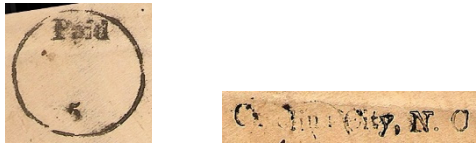
The 5-cent black Carolina provisional (left) and control marking (right) CAR-NC-E01

The Carolina City provisional was prepared by stamping envelopes with a typeset “PAID / 5” marking and adding a straight-line “Carolina City, N. C” typeset control marking.