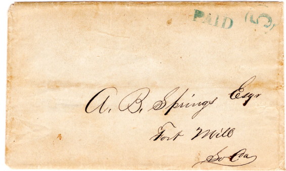
Image Credit: Collection or Exhibit on Civil War Philatelic Society Website.

Source: CWPAS-04062*; CWPSX-Crumbley(Jan2020)-2*. [001]