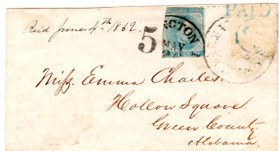
Image Credit: Collection or Exhibit on Civil War Philatelic Society Website.

Source: CWPAS-04061*; CWPSX-Crumbley(Jan2020)-2*. [002]