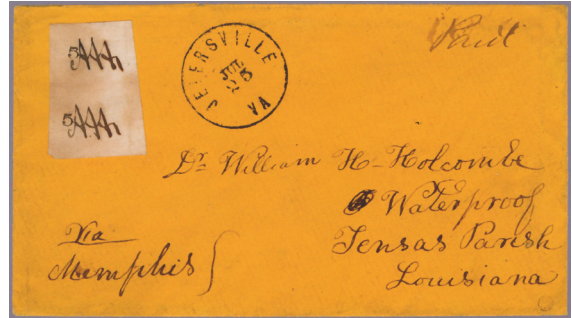
Image Credit: Postmasters' Provisionals: United States and Confederate States (2016 book by Haub).

Source: PPH-107*; GIL-14Jun1922(98-4)-8; HRH- 5Mar1956(989-3)-152; RAS-27Apr1967(317)- 321. [001]