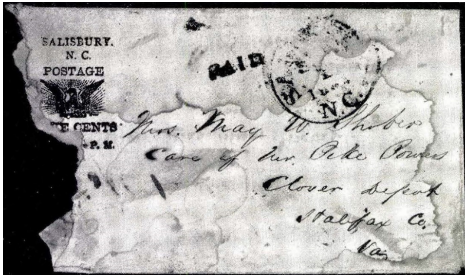
The cover as it appeared in the Caspary sale. Note the torn off left edge that took part of the provisional design.

The following images show how the Salisbury provisional cover has changed over the years as the result of restoration work.