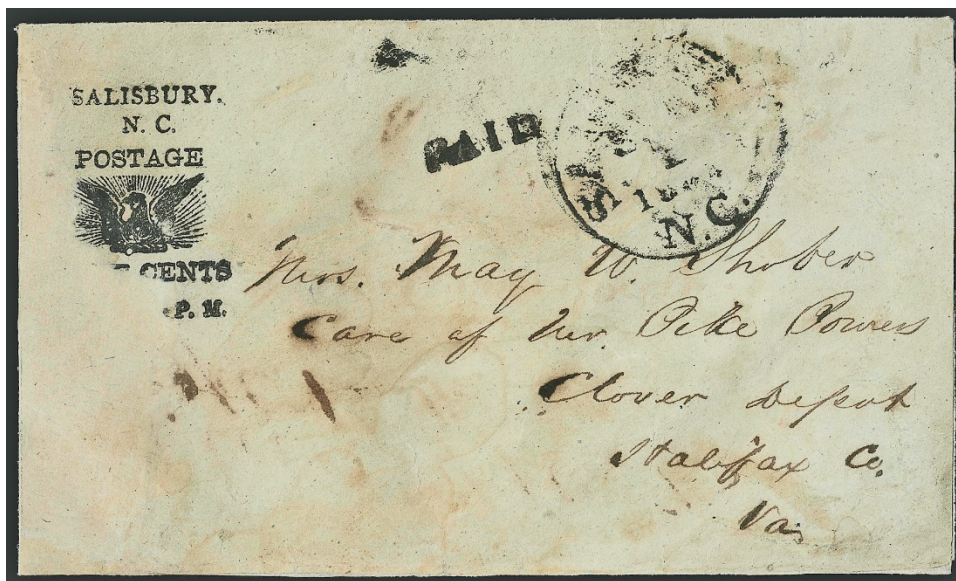
The cover as it appeared in the Brandon sale after expert restoration work.