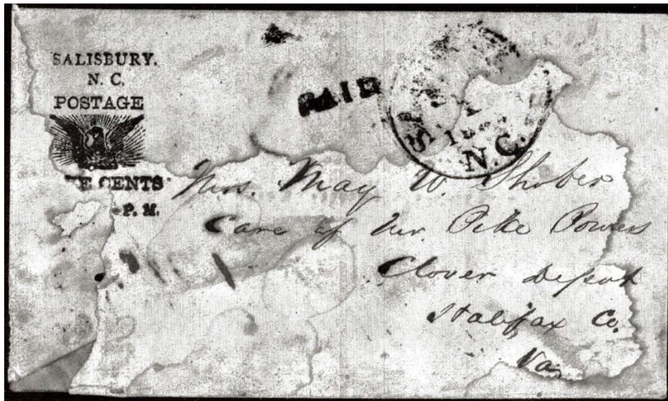
The cover as it appeared in the Solomon sale. Note the rudimentary repair made to the left side to fill in part of the envelope that was torn off.