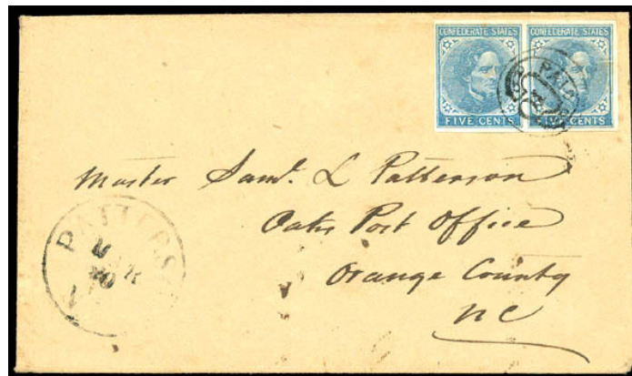
Pair of 5c #7 just tied by Patterson fancy “PAID 10” marking. Courtesy Schuyler Rumsey Auctions (Sale 24, Lot 331).

The same markings used as provisionals were also used to cancel stamps. These are not provisional uses. Two examples are below.