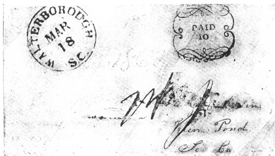
Image Credit: Philatelic Exhibit on US Philatelic Classics Society Website.

Source: CSX-Hill(Aug1996)-13; RCF-3May1986(28)-531. [006]