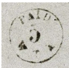
JAC-AL-E01 The Jacksonville Provisional

The Jacksonville provisional was prepared by handstamping envelopes with a specially prepared device that reads "PAID / 5 / W T A."