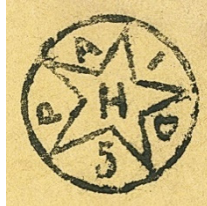
PEN-FL-E01 The Pensacola Provisional

The Pensacola provisional was prepared by handstamping envelopes with a fancy woodcut featuring a star with the word "PAID" and "5" between the rays of the star. In the center of the star is letter "H." The significance of the letter "H" is unknown.