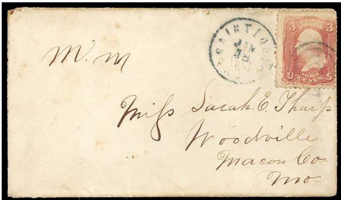
St. Louis Prisoner of War cover from Gratiot Street Prison