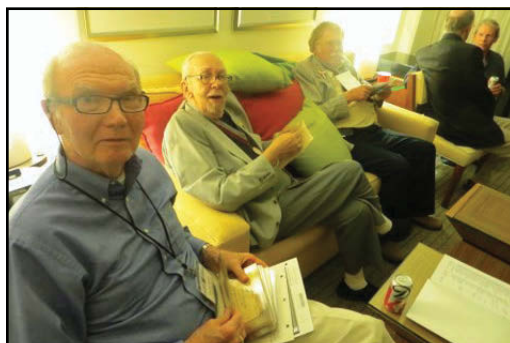
Socializing and viewing covers in the hospitality room.