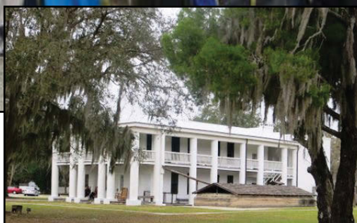
Gamble Mansion, refuge of Judah Benjamin.