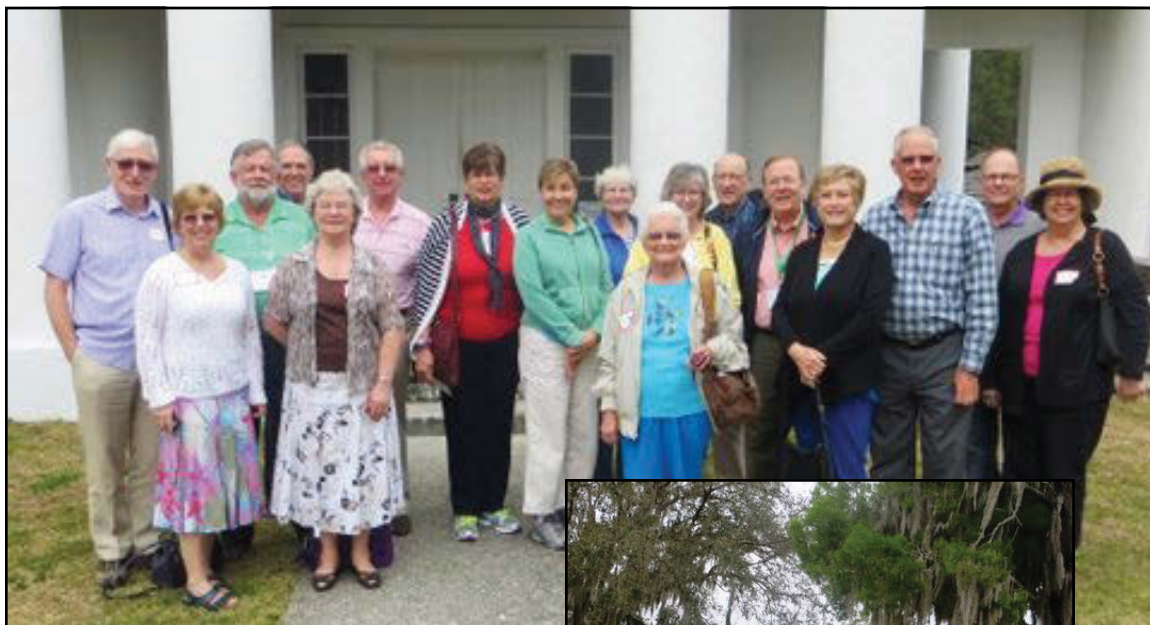
CSA members and guests at Gamble Mansion.