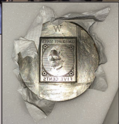
The De La Rue CSA die.