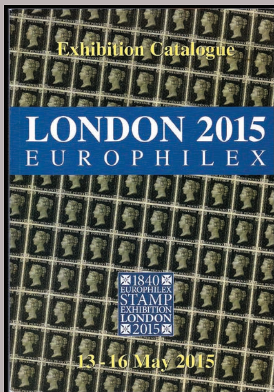
The London 2015 Europhilex Exhibition Catalogue.

Finally it was great spending time with European members, some who had never attended a CSA function.