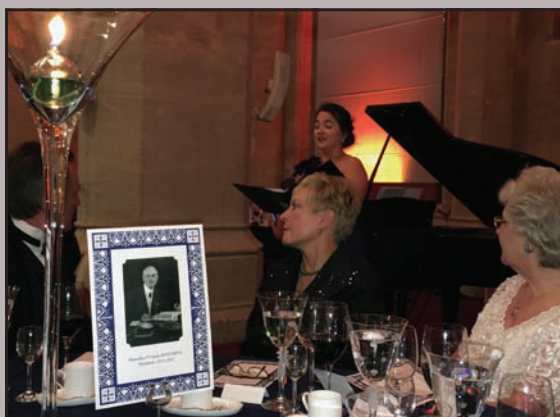
An opera singer performing at the RPSL dinner.