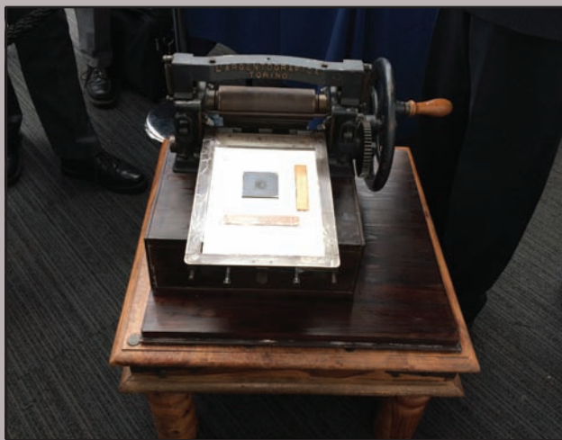
The Sperati press on display.