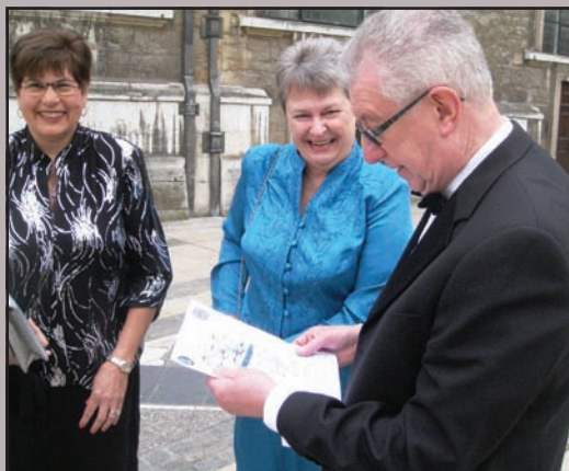
Where is the entrance to the Guildhall?