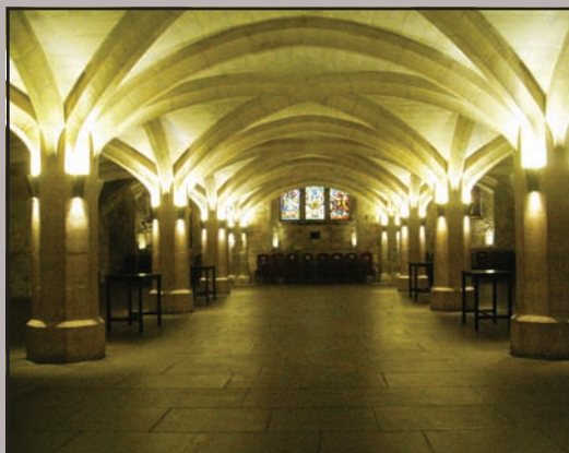
The crypt underneath the Guildhall.