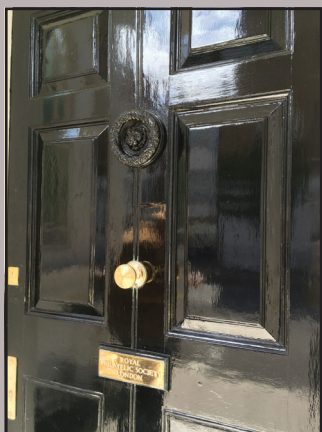
The front door of the Royal Philatelic Society London.